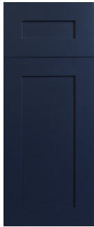
Pure White | Proper Gray | Marine Blue